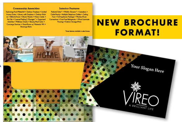
COMPACT POCKET BROCHURE 9" x 6"