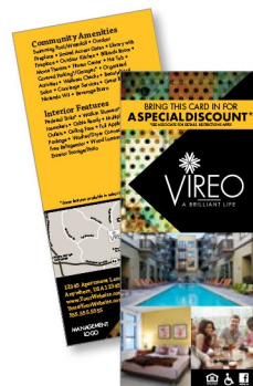
RACK CARD 4" x 9"