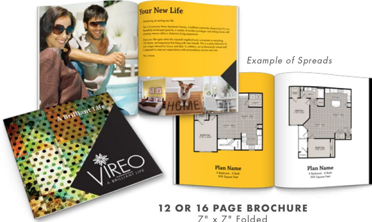
12 OR 16 PAGE BROCHURE 7" x 7" Folded