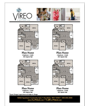
FLOOR PLAN INSERT 8.5" x 11"