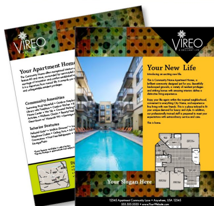
FLYER 8.5" x 11"