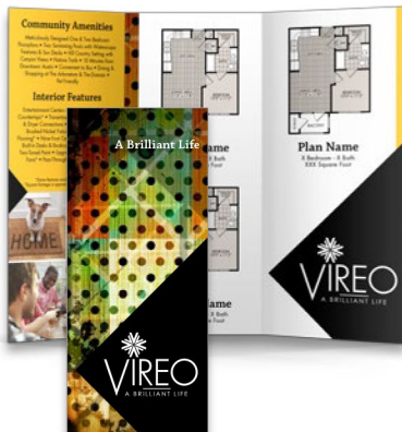
STANDARD TRI-PANEL BROCHURE 3.75" x 8.5" Folded