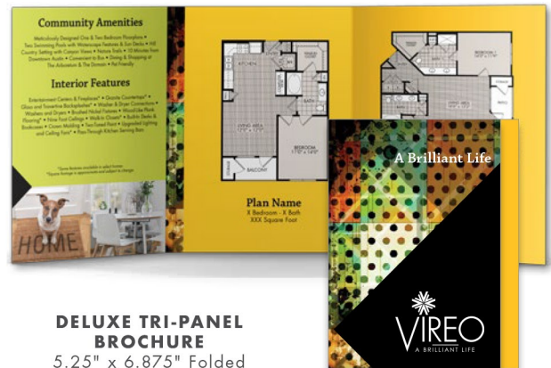
DELUXE TRI-PANEL BROCHURE 5.25" x 6.875" Folded