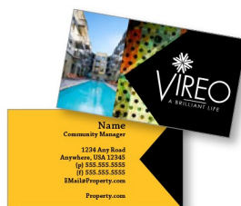
BUSINESS CARD 3.5" x 2"