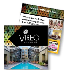
PROMO CARD 4" x 4"