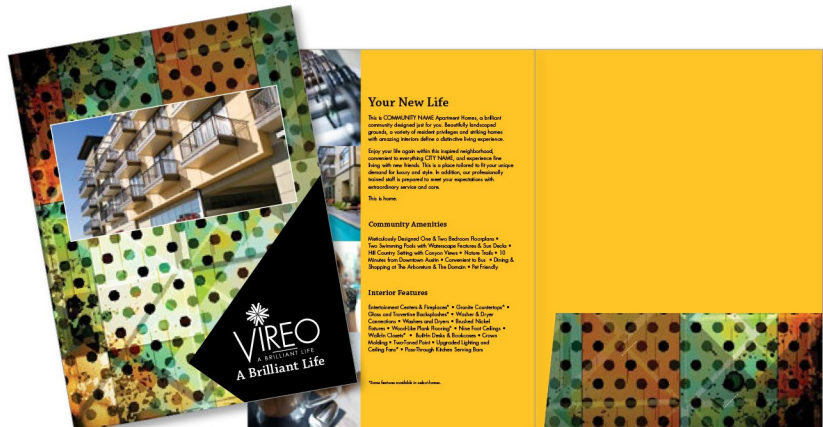
POCKET FOLDER 9" x 12"