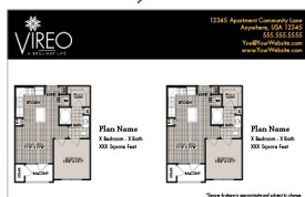
COMPACT FLOOR PLAN INSERT 8.5" x 5.5"