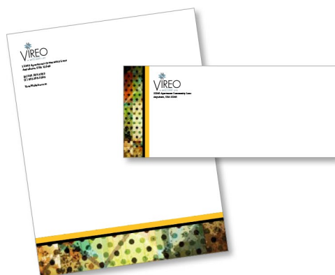
LETTERHEAD W/ ENVELOPE 8.5" x 11"; #10 Standard