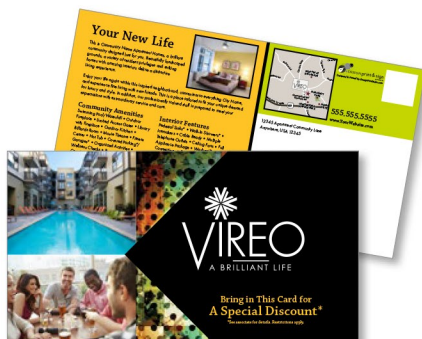
POSTCARD 11" x 6"