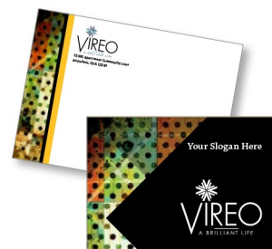
THANK YOU CARD W/ ENVELOPE 6" x 4.25" Folded; A6